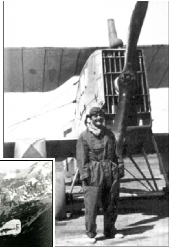
they used could only fly for 500km at a time.

Vachet continued to work in South America for Aéropostale, opening up more lines and then for Air France. He enjoyed a long career and died in 1974.