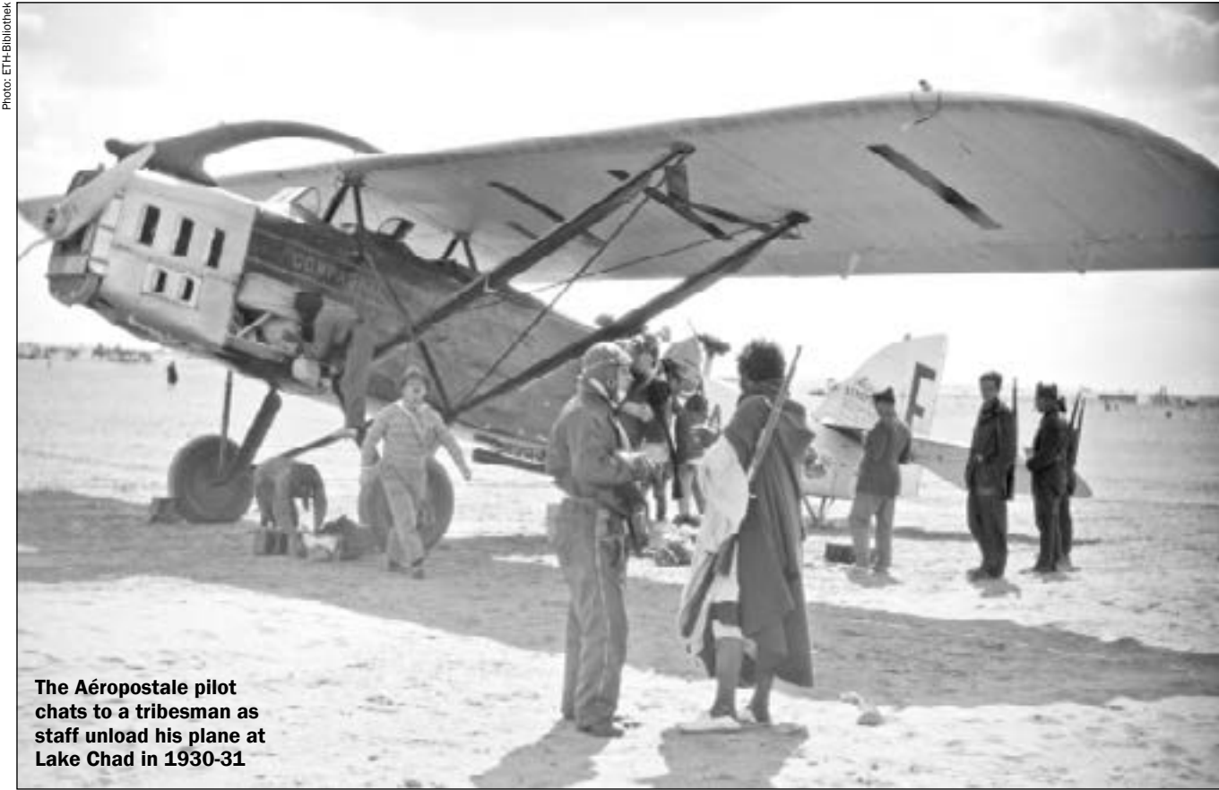
The Aéropostale pilot chats to a tribesman as staff unload his plane at Lake Chad in 1930-31