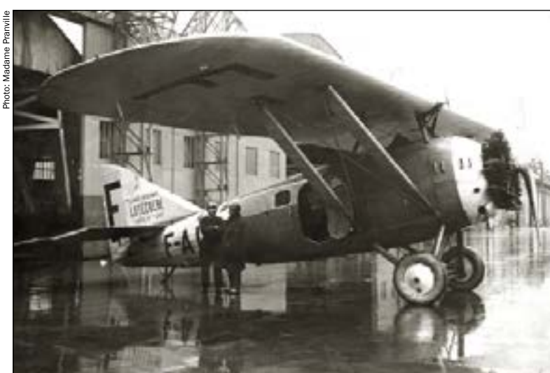
A Latécoère 17 plane like the one which was found near Toulouse

The Mémoire association already has several temporary Aéropostale exhibitions on three continents and the Toulouse museum, called La Piste des Géants, will be at Montaudran.