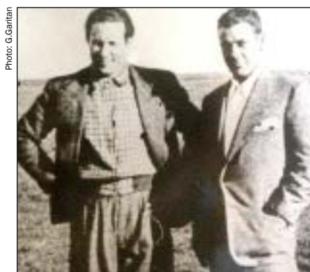
Jean Mermoz and Henri Guillaumet in Rio

He died on November 27, 1940 when flying the new high commissioner to Syria. He was shot down by an Italian plane but Britain was initially blamed.