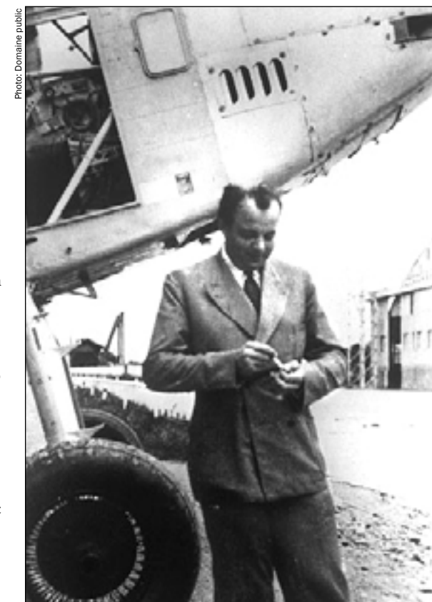
Antoine de Saint-Exupéry was a hero pilot and author